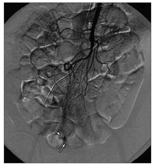
Figure 2. Angiogram of the superior mesenteric artery shows active bleeding from branches of ileocolic artery (arrows).

obtained, yet no source of bleeding was observed. As there was no evidence of vasospasm, the bleeding was thought to have spontaneously stopped during the procedure; therefore, embolization was not possible. The patient again became hemodynamically unstable (mean arterial pressure dropped 35 mmHg during the next 2 h) and his hemoglobin level decreased from 9 g/ dl to 6.6 g/dl despite intensive transfusions. The patient was immediately taken to surgery. During laparotomy, hemorrhagic findings were present, but no accompanying gross pathology was detected in the bowel segments. Right hemicolectomy and ileostomy